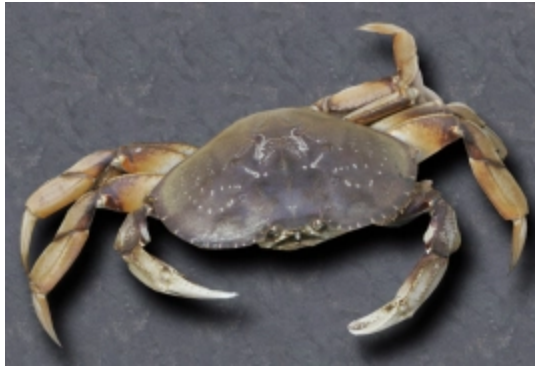
Dungeness crab.